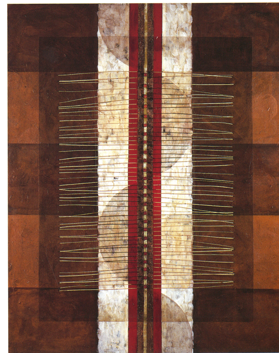
"Copper with Curves," mixed media, 60" × 48"

Nancy Pendleton's paintings are shown at Adieb Khadoure Fine Arts, located at 610 Canyon Road. Hours: 9:30-6:00 daily. (505) 820-2666 or 1-877-820-2666. akhadoure@aol.com, www.khadourefine-art.com.